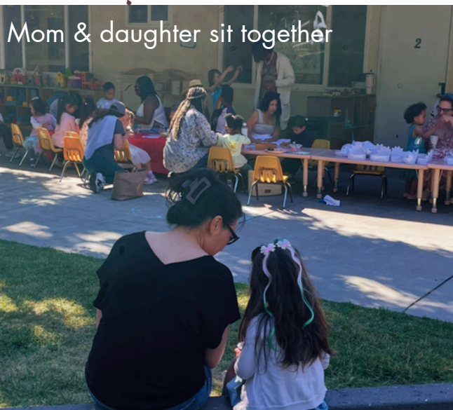
Mom & daughter sit together

April showers brought an abundance of May flowers because our preschool continues to grow, and our staff is magnificent. We now have Mount Olive t-shirts and sweatshirts on sale for both children and adults. We celebrated a “Muffins with Mom” event, and most of our wonderful families were able to attend. Our fabulous families showered us with magnificent gifts during Teacher Appreciation Week, including cash, gift cards, lunches, and treats!