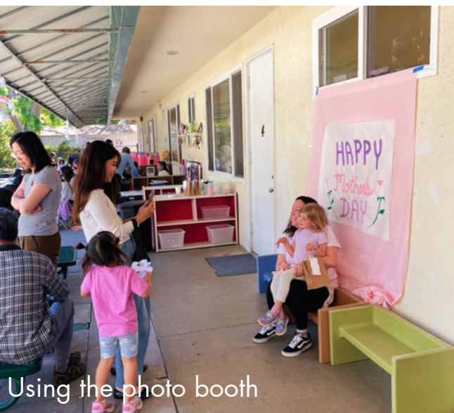
Using the photo booth